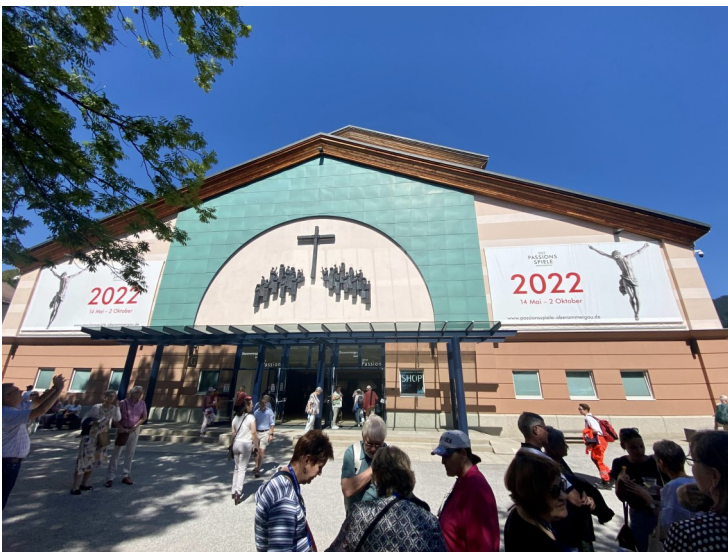
The Passions theater in Oberammergau. From May to October about 4500 people view the play per day.

A special moment for me was at the very beginning of the play when Jesus entered Jerusalem as great multitudes of people shouted "Hosanna to the Son of David," It felt as though I was transported back in time and was personally welcoming Jesus with palm branches swaying. The cast of villagers including adults, children, and even live animals made is all so real. I was awestruck. I'm so grateful for this spiritual blessing in my life.