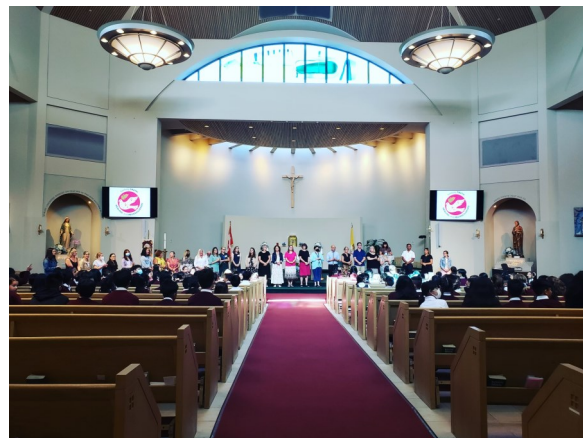
School Opening Celebration Staff Introductions., Sept. 6