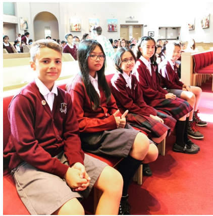
Student Network Mentors