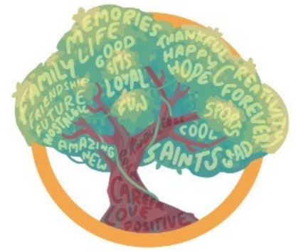
TREE OF MEMORIES 90 YEARS OF ST. MARY'S SCHOOL