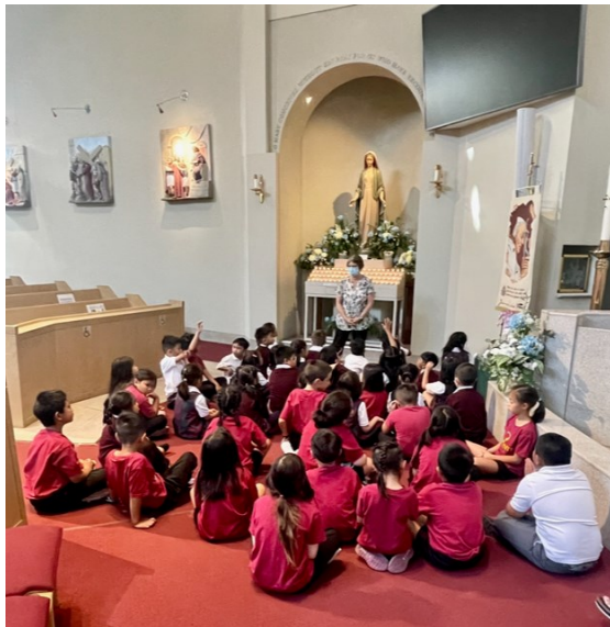
On September 8th, students in grades one and two honoured our heavenly Mother. We went to the church and gracefully sang Happy Birthday to her!