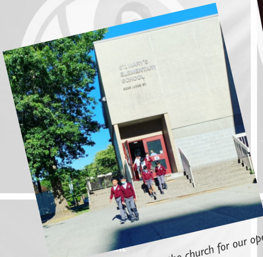
Classes make their way to the church for our opening blessing