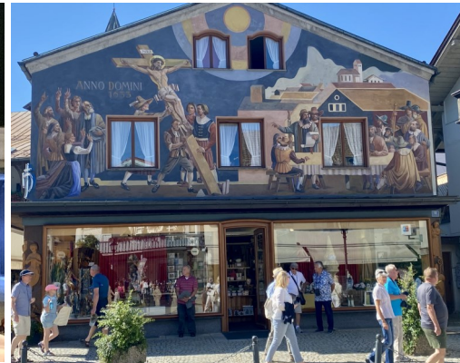
Ticket to the Passion Play 2022; the Play was postponed for two years due to the pandemic.